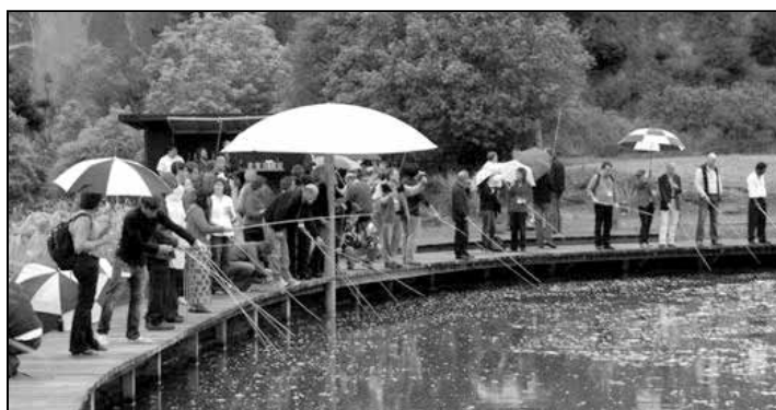
Attendees of the Australasian Regional Conference fishing for their prawns.