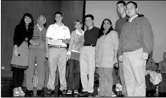
C.R.Rao with participants of the track on Biotechnology at the conference.